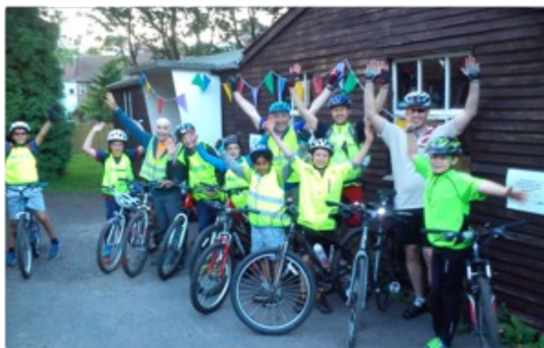
(Above - Our Scouts setting off on a 20km bike ride)

Our big fundraiser of the year. Set your alarm clock and tell your friends. There will be a large range of quality trees of different sizes on sale. Come and buy yours.